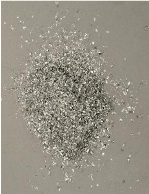
Figure 1: Lathe machine

Titanium dioxide ( \text{TiO}_2 ) is also called Titania, which is a substance manufactured from selected sand. KMML is India's first and only manufacturer of Rutile Grade Titanium dioxide by chloride process. The chlorides of impurity metals are removed from Titanium Tetra Chloride ( \text{TiCl}_4 ) by various processes to complete the manufacture of \text{TiCl}_4 . It is further purified by distillation to obtain pure Titanium Tetra Chloride in the liquid form. Titanium Tetra Chloride is vaporized, pre heated and oxidized with oxygen in the Oxidation Plant to produce raw Titanium Dioxide at a high temperature. The raw Titanium Dioxide is then classified and surface treated with various chemicals, filtered and washed to remove the salts, sent to the dryer. The Titanium Dioxide pigment in powder form which is as an ingredients in the manufacture of paints. The effluents generated due to the production of \text{TiO}_2 contain the various chemicals and it leads to the problems of disposal and degrading the environment.