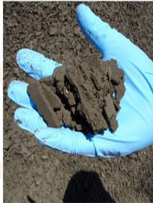
Figure 2: ETP sludge